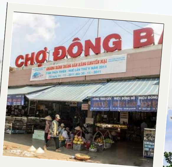
Dong Ba Market